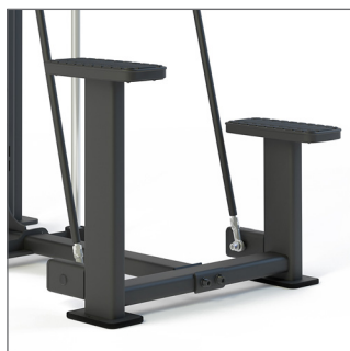
Dual Step Up: allows for safe entry/exit.