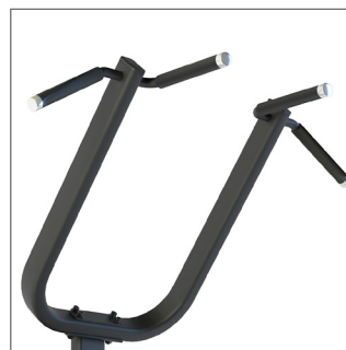
Multi-Position Chinning Handles: allows for both a narrow and wide grip position.