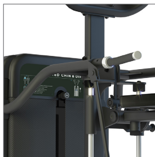
Multi-position dip handles: allows focus on either wide and narrow dips.