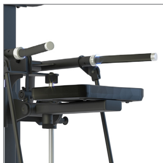
Kneel pad; optional lock down for unassisted training.