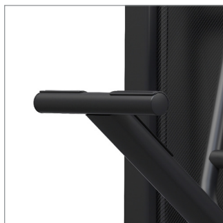
Foot assist bar