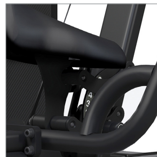
Seat and lever / manual adjustments