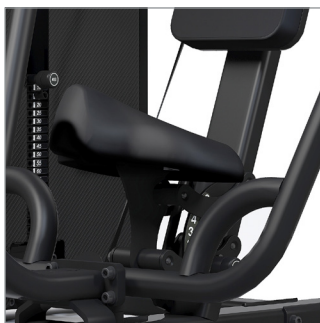
Low handlebar arm pivot