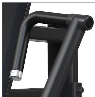
Multiple hand-grip positions